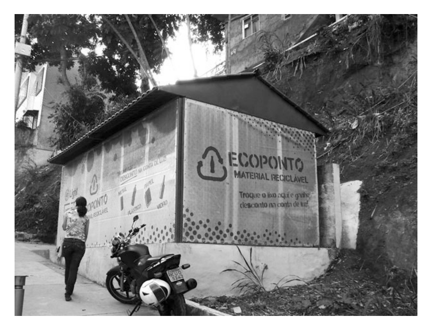
Figure 6.1 A Light Recicla collection point

to energy. Light Recicla was designed as a complex service resulting from the combination of two services: delivery of electricity and collection of recyclable materials. The parent company – Light – itself managed the delivery of electricity. Meanwhile, a Light partner operated the collection of recyclable materials. Electricity was delivered in the standard way except for the payment system: citizens were requested to bring recyclable materials to dedicated collection points, where the value of these materials was converted into credits towards a discount in their next electricity bill.