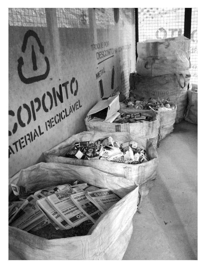
Figure 6.2 Recyclable materials separated at a Light Recicla collection point

Recicla service, the company got paid for the energy it provided (even though the bills were paid in a way that was far from conventional).